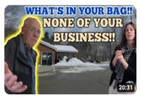
BOARD MEMBER *GETS OWNED* RINDGE, NH TOWN HALL 1ST AMENDMENT AUDIT... 71K views + 1 month ago

SECURITY MANAGEMENT *OWNED* DISMISSED (NO SIGNS) 1ST AMENDMENT... 113K views • 3 weeks ago