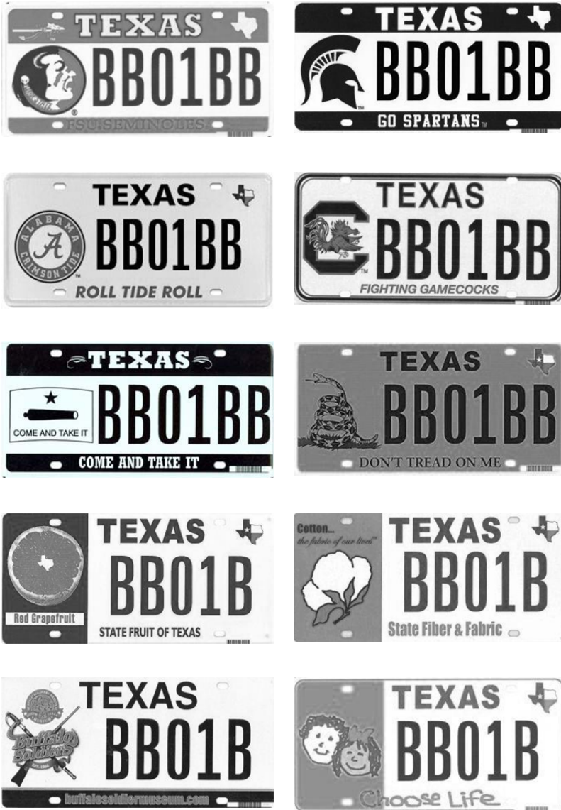
All found at http://txdmv.gov/motorists/license-plates/specialty-license-plates